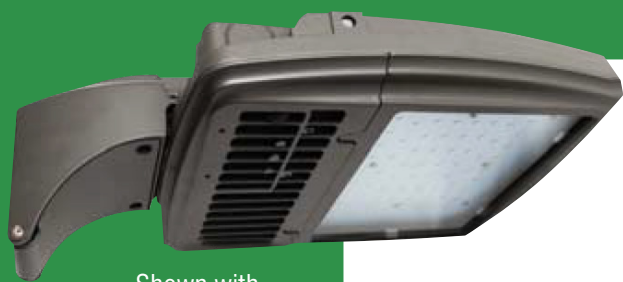
Shown with Kitty Hawk arm